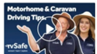
3:19 VIDEO Motorhome and Caravan Driving Tips