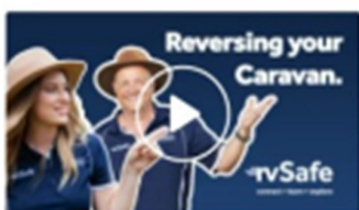
2:47 VIDEO Reversing your Caravan