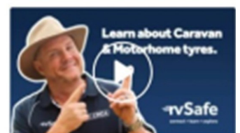
2:12 VIDEO Learn about Caravan and Motorhome Tyres

RV Safe also has a list of RV Road Rules which can be found here:-