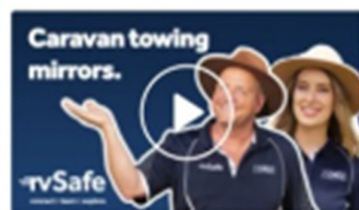
2:56 VIDEO Caravan Towing Mirrors