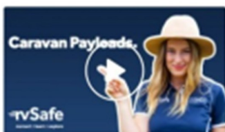
3:15 VIDEO Caravan Payloads

The image below is just a picture — meaning you cannot click on it and go to the video.