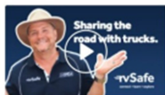
1:35 VIDEO Sharing the Road with Trucks