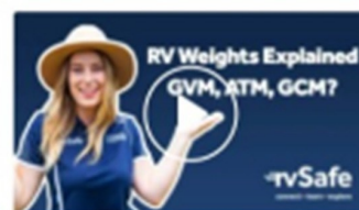
3:39 VIDEO RV Weights Explained – GVM, ATM, GCM?